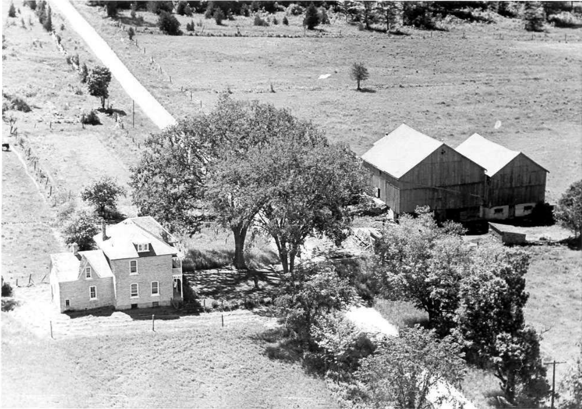
Blyth(e) family home