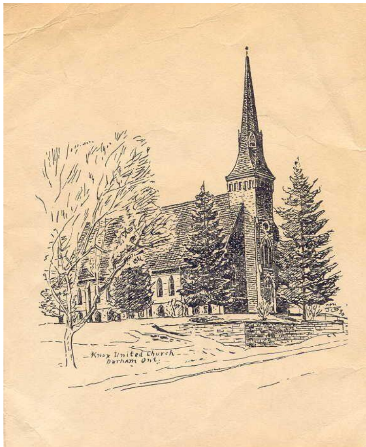
Knox United Church, Durham