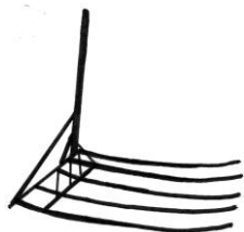
Drawing of a cradle.