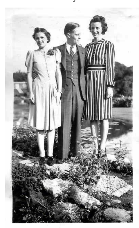
City of St. Thomas Waterworks Park, 1940