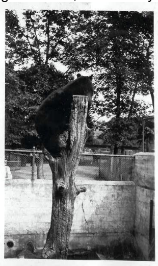
Springbank Park, Labour Day 1940