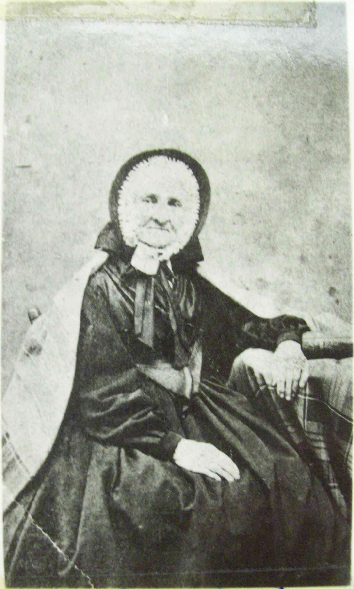
Ann Case Born July 3 1770