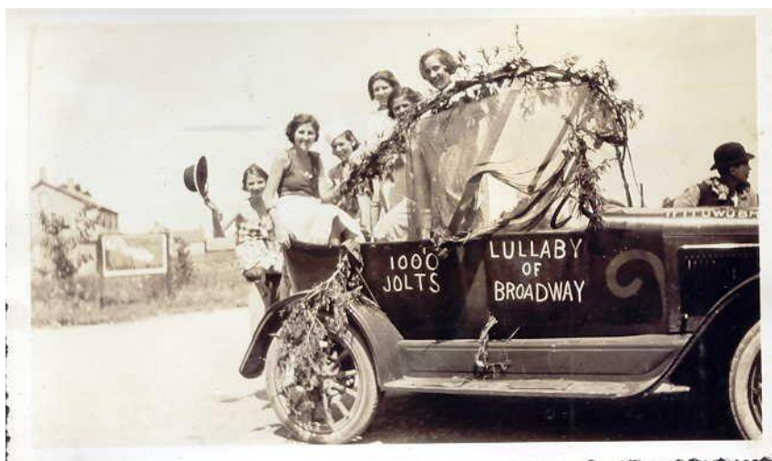
Velma second left